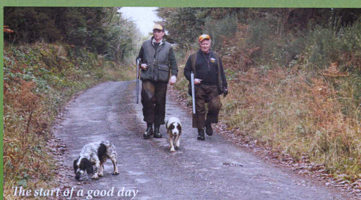
The start of a good day