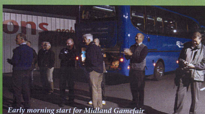
Early morning start for Midland Gamefair