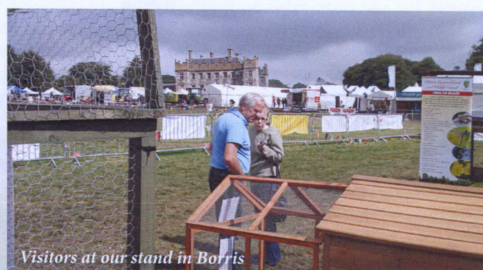
Visitors at our stand in Borris