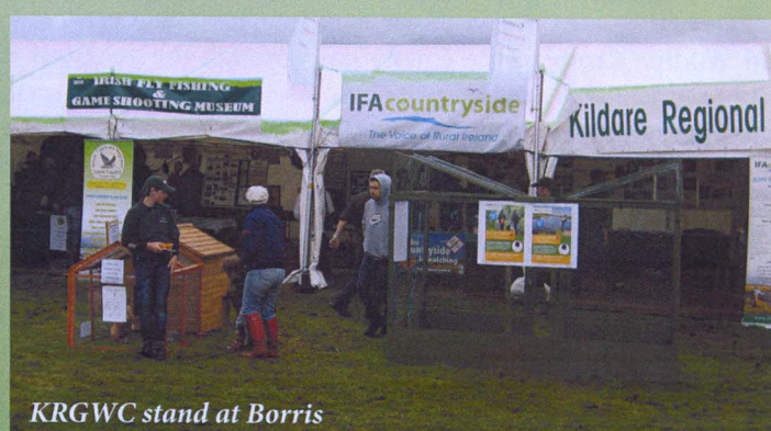
KRGWC stand at Borris