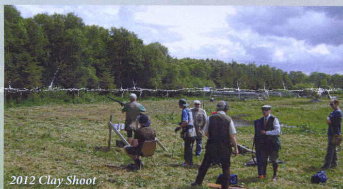
2012 Clay Shoot