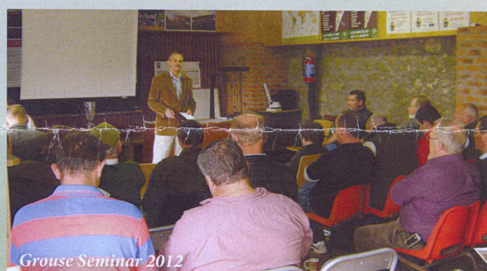
Grouse Seminar 2012